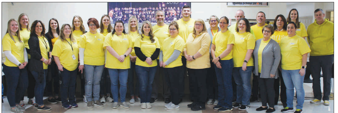
Seneca East staff wearing Yellow for Spreading Kindness Week at SE Kindness Club members delivering at The Blossom Center in Willard